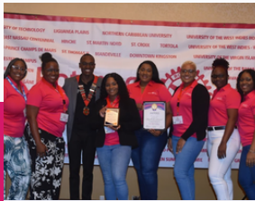
03. Awards & Recognition