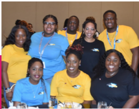
02. Professional Development