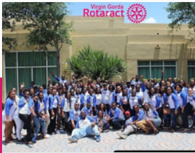
04. Community Service