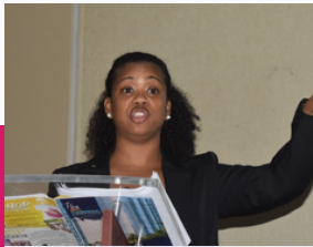
05. District Business