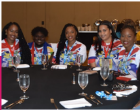
01. Rotary Training